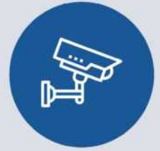
24 x 7 CCTV Camera