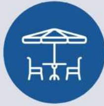
Senior Citizen Seating