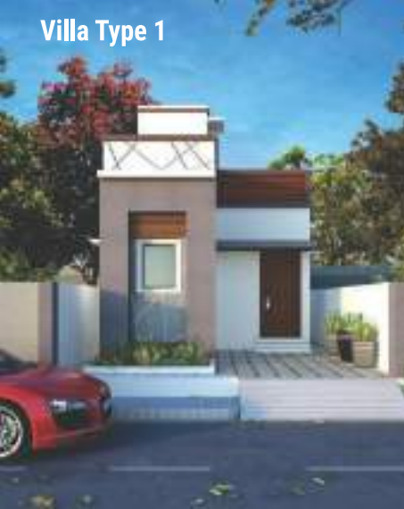
Villa Type 1